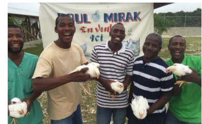
Poul Mirak Chicken Co-op