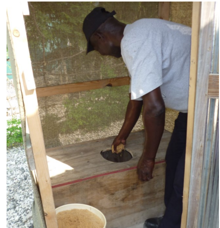
Arborloo is a communal compost toilet.

The advantage to this type of compost toilet is its simple technique. That's what "appropriate technologies" are all about. It is low cost in a third world country. There is low risk of transmitting disease since there is no moving the waste; in-