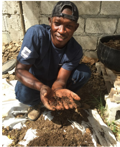
Worm farming helps depleted soil.

At the Agricultural Training Center, we use the African red wiggler, Eisenia fetida , as it is almost certainly the most widely known and used composting worm.