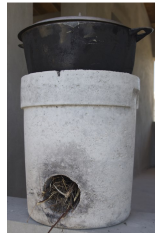
Reduces the need for charcoal.

We have designed our own rocket stove that begins with a five gallon bucket that becomes a mold for concrete. With an interior vertical chimney, the heat is directed straight up to the cook pot. In trial tests in India, the rocket stove used 39-47 percent less fuel than the three-stone fire that is typically used in Haiti and burns cleaner, thereby making it much healthier.