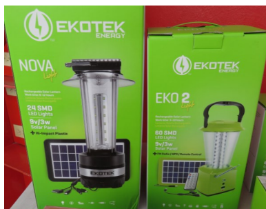
Solar lanterns can last 8-12 hrs.

Seven years after the 2010 earthquake that devastated Haiti, the country's electric utility remains the same: it is mostly inconsistent and unavailable. Only about 25% of the 11 million residents have access. Of