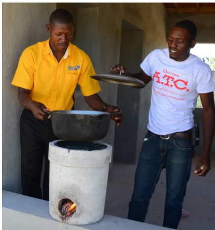
Rocket stoves improve cooking time.

“Appropriate technologies” amount to devising helpful ways of improving everyday chores that are simple and economical. With appropriate technologies as one of the six key components of Love A Child’s Sustainability Plan, improving how