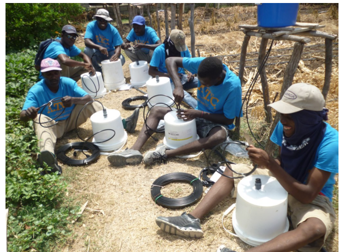
ATC Extension students assemble Chapin drip irrigation kits.

Training topics for the extension course included: soil science, preparing soil, making planting beds and even creating “tire gardens.” They also