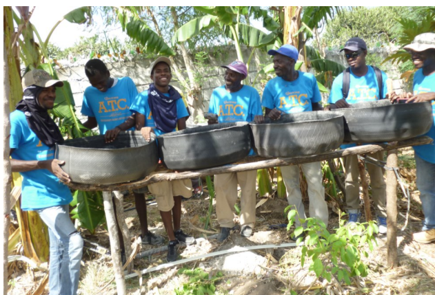
Learning to re-purpose old tires for raised gardens at the ATC.

Your support of this important new training program will extend the benefits of the sustainable agricultural training to many other villages and areas of Haiti. Thank you for helping us help many Haitian families regain food security for self-reliance.