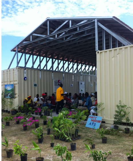
Classroom learning at the ATC.

Listed at right are several beneficial sustainability projects Love A Child has mapped out for the future. If you have a heart for sustainability, take your time to prayerfully consider how you want to help educate the Haitian people.