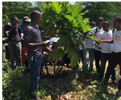
Agricultural Training Center

The Agricultural Training Center , with the chicken co-op and the Marketplace , work together to provide a comprehensive approach to developing self-sustainability.