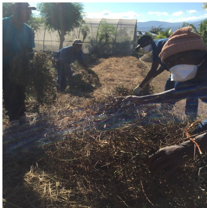
ATC staff adding mulch to the demonstration gardens.

At the Agricultural Training Center, one of the sustainable methods we teach is the use of heavy mulches and composts. Recently the staff was adding more heavy mulches to the demonstration gardens, which now have green peppers growing in them.