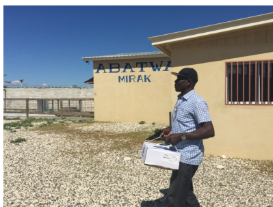
Fast Fact: The Abatwa Mirak Meat & Fish Market officially opened in August 2015.

The Gwo Mache Mirak slaughterhouse (Labatwa) is getting more active each week and earning a solid reputation as one of the best places to buy premium meat products in Haiti. New customers are