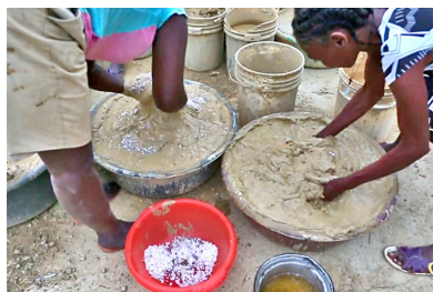
Mud cookies in production.

In the village of Sapaterre, Haiti, many women and children have to spend their days making “mud cookies” to sell. Out from the mud and poverty, generations of families spend their lives working to sell cookies made of nothing more than mud, oil, salt, and water. It is “food” for the poorest