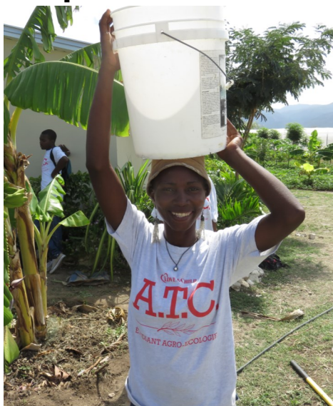
Getting a first-hand experience at the ATC is made possible through donors like you.

Listed here are several beneficial sustainability initiatives that Love A Child has developed to lift Haitians out of poverty. If you have a heart for sustainability, take your time to prayerfully consider how you want to help educate the Haitian people.