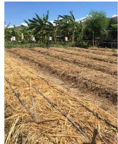
Mulch covering the ATC demo garden.