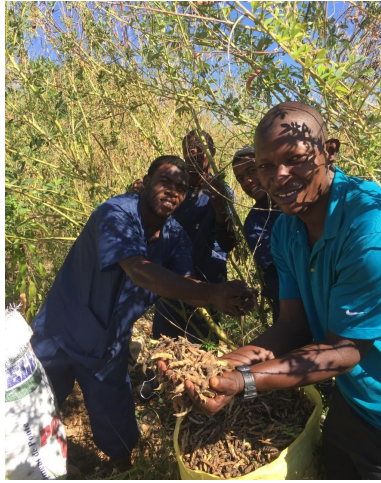
Pwa congo (pigeon peas) being harvested.

This new garden area is important to the Love A Child sustainable agriculture program because it is a larger scale orchard and garden which provides sustainable foods for the kitchens at Love A Child Village (where the orphanage, malnutrition clinic, and schools are). This Vergé is also where we have planted many of our important trees and crops which we want to be sure we always have a