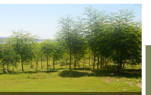
Erosion Control Efforts: Increasing Soil Quality and Sustainable Food Production